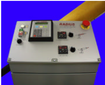
Enclosure control panel for operator interface in "Stand Alone" mode