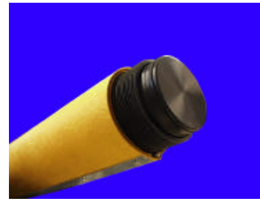
Easily retracted and removable piston for ease in cleaning and seal replacement